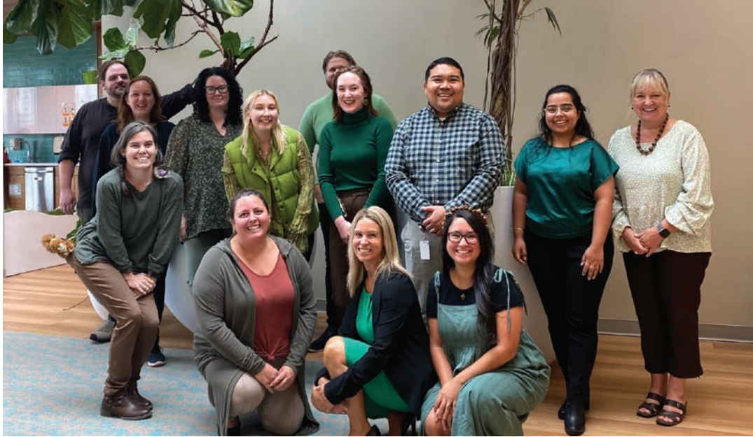
Home Office team members celebrating National Tree Day September 20 th