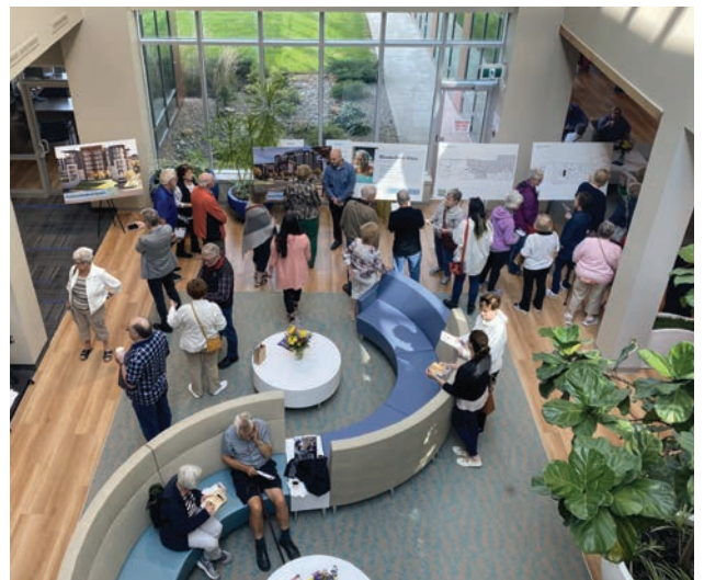
Bedford Square information session at Home Office, NS

On September 23 rd , neighbours were invited to see what's blooming in Bedford Square. Bedford Square will bring a fresh and inviting energy to the area that will inspire social connection and living well as you age. Neighbours walked through site plans, enjoyed a fly-through video of the community and were treated to local refreshments.